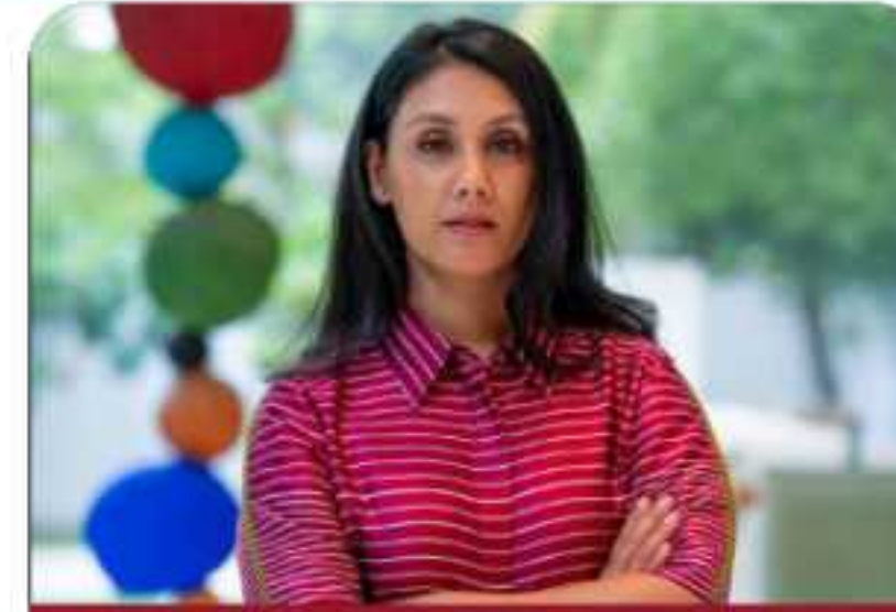
MRS. ROSHNI NADAR MALHOTRA

Chairperson – Kiran Nadar Museum of Art Trustee – Shiv Nadar Foundation