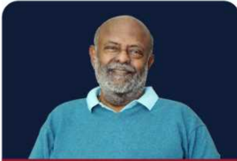
MR. SHIV NADAR

Founder – HCL Chairperson Emeritus & Strategic Advisor – HCL Tech Founder & Chairman – Shiv Nadar Foundation