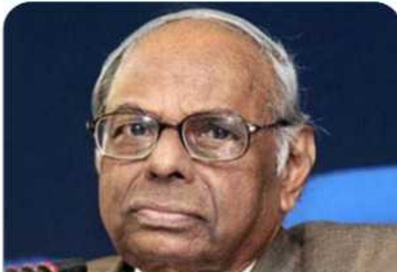
PROF. C. RANGARAJAN

Chairman – Madras School of Economics Chancellor – University of Hyderabad Ex-Governor – RBI Former President – Indian Statistical Inst.