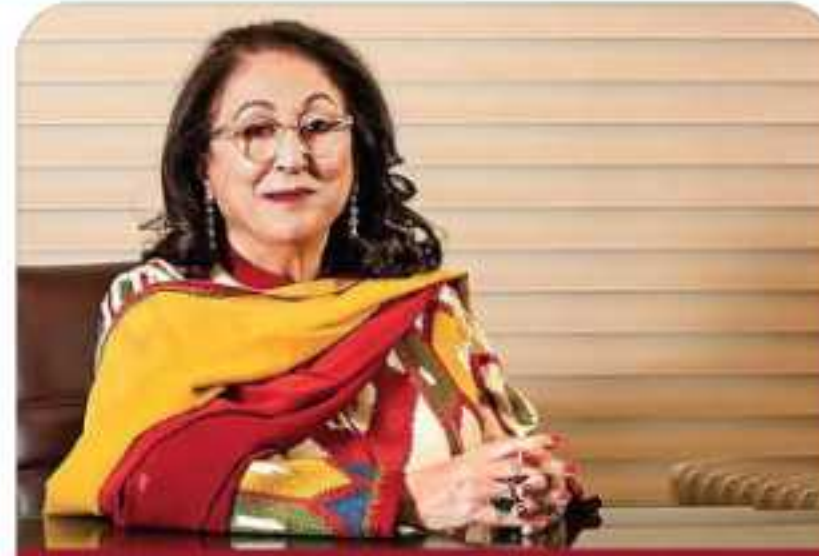
MRS. KIRAN NADAR

Founder – HCL Chairperson Emeritus & Strategic Advisor – HCL Tech Founder & Chairman – Shiv Nadar Foundation