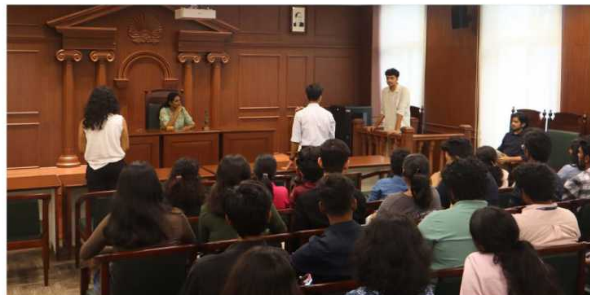
– Moot Court Session at the School of Law